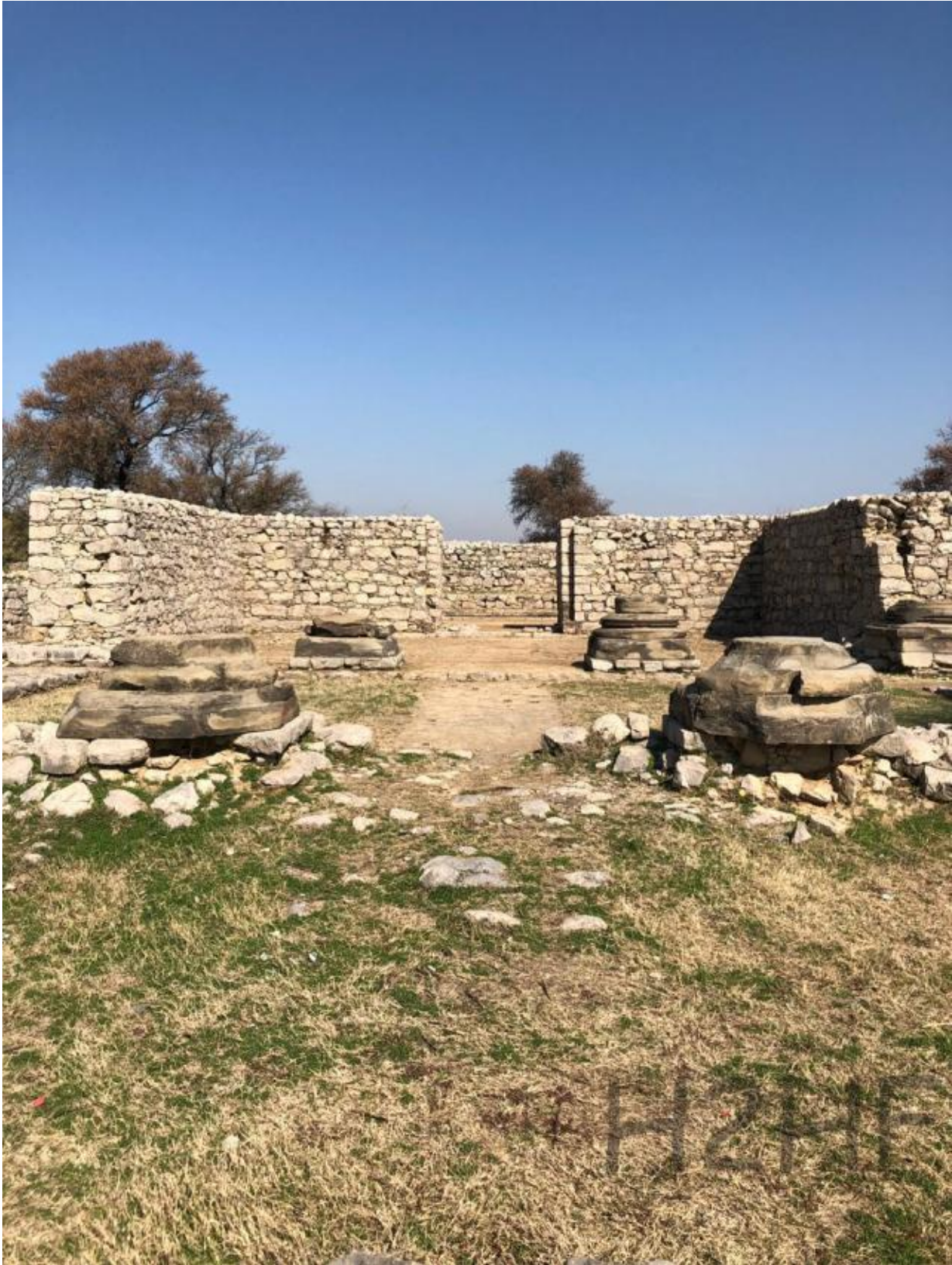
The oldest Jain temple in Pakistan