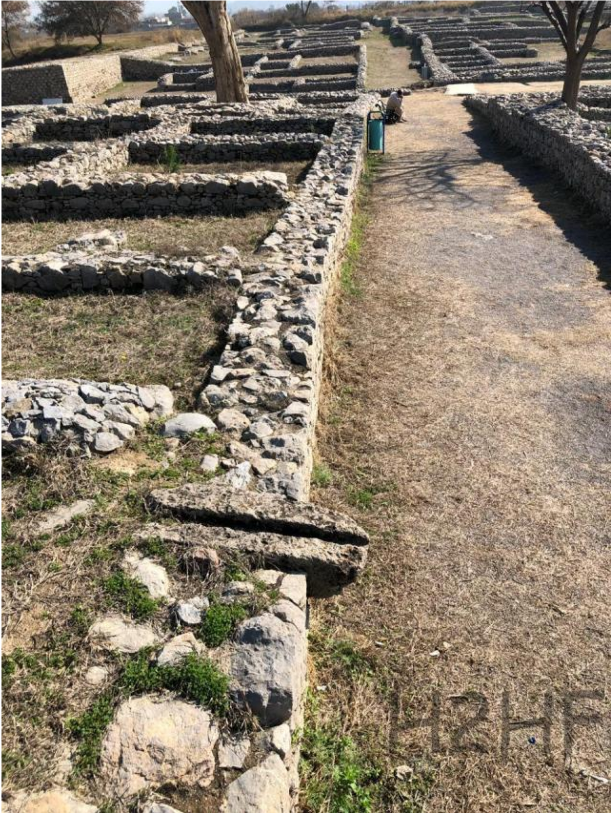
The oldest Jain temple in Pakistan