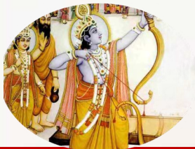
Sri Ram snaps the bow.