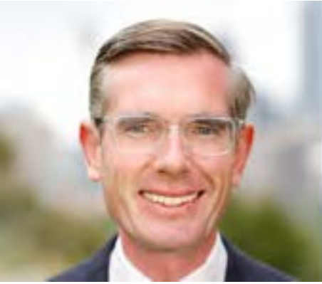
Dominic Perrottet MP Premier of New South Wales