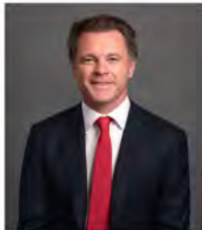
Chris Minns MP NSW Labor Leader