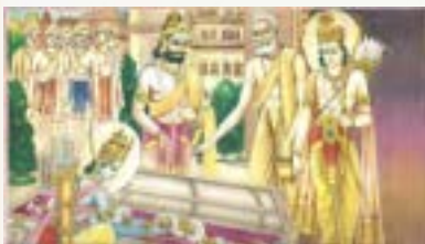
Sri Ram looking at the bow to be lifted.

Valmiki does not mention any Swayamvar organized to lift the bow contrary to Ramcharit Manas that it was.