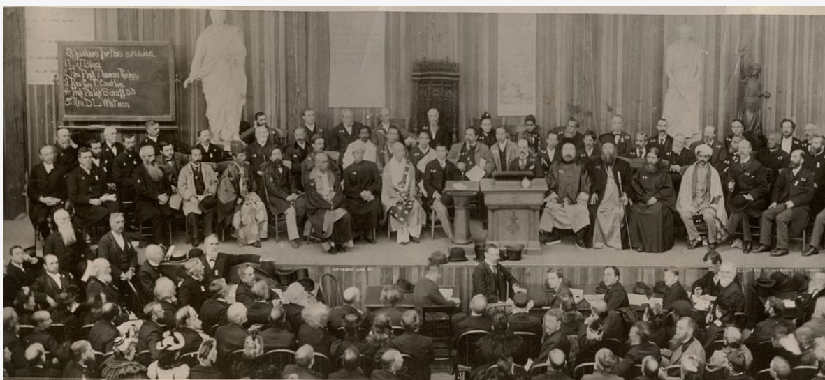
Parliament of World’s Religions 1893